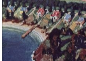
Above is a poster, probably in the 50's used by Cadburys. If you increase the size you can see a beach on the bottom left

and some houses that seem bigger than actual—most likely artist's poetic license.