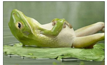
Is Bucky still sunning himself in Queensland?

Now that the new trousers are stating to be picked up some of us may find we have put on a bit of weight during winter, and some may have even taken some off. When we all get a chance to wear the new colour coordinated maroon bloomers we will notice the difference. All members are reminded that we expect matching underwear to be worn as well. (I lied about that). Can anyone tell us whether maroon socks will be in order to be worn?