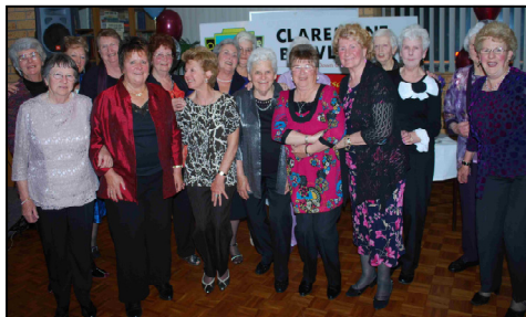
(above) Some of our lady members, present and past.