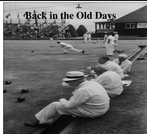
(above) In days gone by the ladies would bring out the afternoon tea and the gentlemen would sit on the edge of the green enjoying a cuppa.