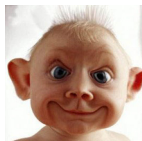
Only a mother could love him!

This woman Lawn Bowler goes down south and has a baby and the doctor ask what are you naming the baby, she said odd and the doctor says odd? "yes o-d-d, odd." A few years later Odd is at school playing and they are making fun of him "ha, ha your odd, your name is odd." a few years later he gets married and tells his wife don't put my name on my head stone and she ask why and he says it is odd. Then a few years later he dies and his wife does as he asks, she did put his name on the head stone, then people walked be and said: "My that's odd."