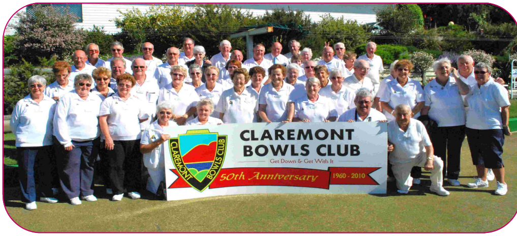
(above) The Visiting Group from NRDBA which joined in the Cadbury's Fours Last Monday