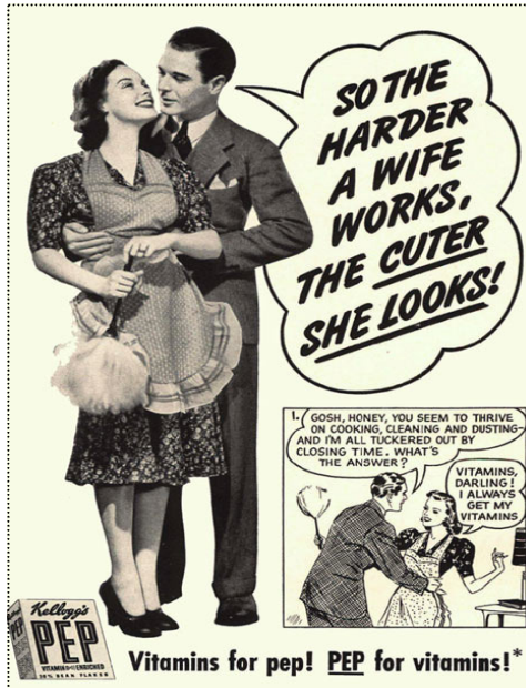
Some of the rubbish that add men got away with in the 50/ 60's

Sorry, but because I go overseas on 19/12/10, next week's (12/12) issue of Drawshot will have to be the last this year. I expect to begin again by mid January, but might have problems with hard copies as our printers are away all January. Check the web site.