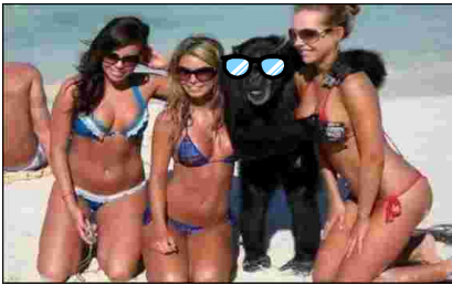
(above) One of my holiday photos