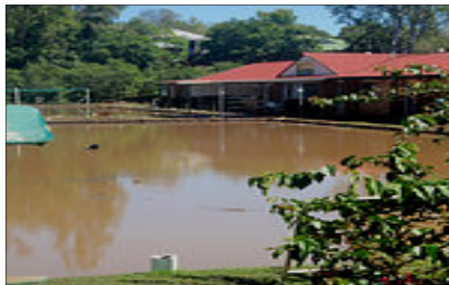
Bardon Bowls Club in Queensland didn't escape the recent floods.

In the lower divisions we have seen too many clubs unable to make up a full team, or forfeit the whole game or just one a rink and several sides have pulled out all together. This does not reflect well on their club and bowls in general. There was a time selectors would contact other clubs to see if any subs were available. The rule regarding teams short of a full compliment are quite interesting. So much so that I will give you two examples of how it may be applied: - Example 1: Team A has a full team Team B is one short, so two players in that rink have 3 bowls each & loose 25% of their score. Final result: Team A d Team B 10-4 (80 – 60) The team with one short were beaten 40-10, allowing for the 25% LOSS OF SHOTS. Example 2; Same two sides. Team B forfeits a rink and loses 2 points. Therefore Team A's total shots drop to 40 and Team B to 50 and Team B wins the game 10-4 (50-40) Also in example 2 one complete rink from Team A and several players in Team B miss a game. You be the judge! Cont in next column