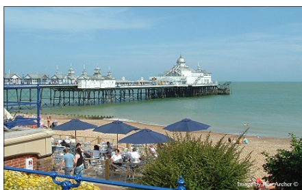
(above) is Eastbourne with its famous pier. Now wasn't Dad's Army, the BBC comedy, based in Eastbourne?

The Club is affiliated to Bowls England, the Sussex County Bowling Association and the Sussex County Women's Bowling Association. The Club is affiliated to Bowls England, the Sussex County Bowling Association and the Sussex County Women's Bowling Association.